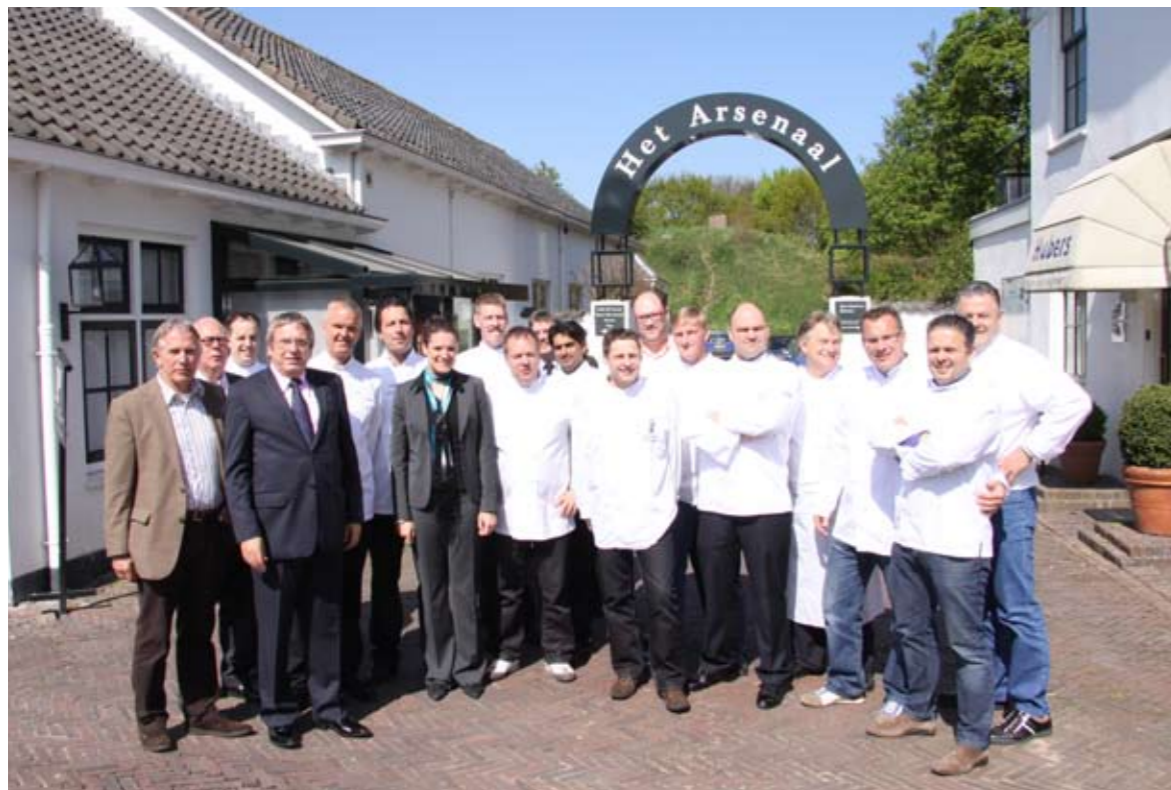
The Dutch Michelin chefs who will take part in Glorida Hotel's project