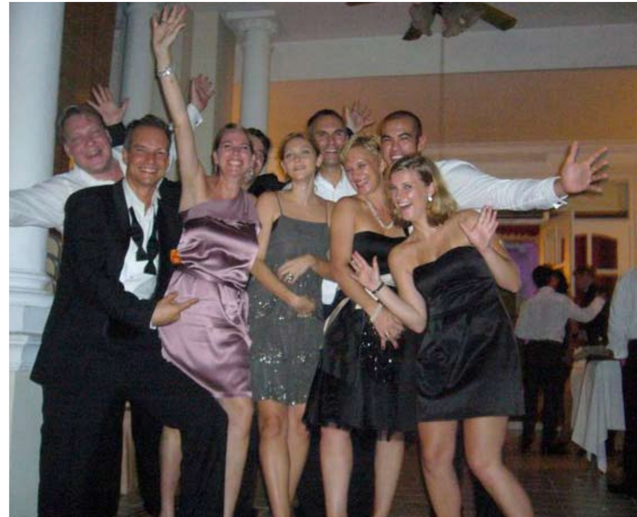
Former student celebrating our Queen's birthday in Kuala Lumpur: