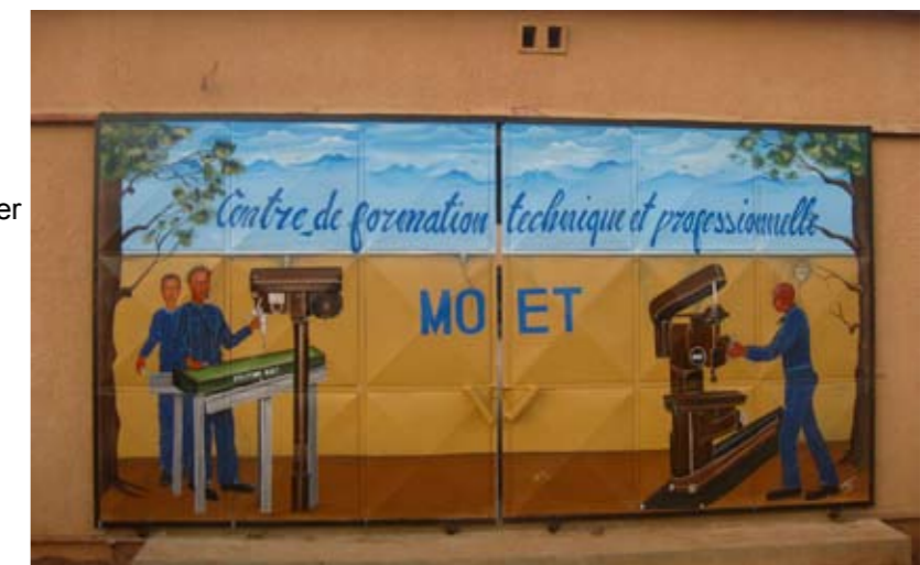
The school in Burkina Faso